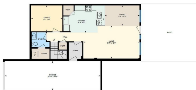
Main Floor: Interior Area 856.69 sq ft Excluded Area 415.67 sq ft