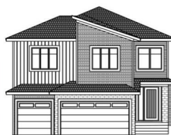
Mirage II - Prairie Modern