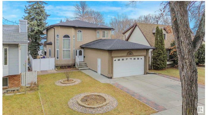
9623 150 St NW, Edmonton, AB