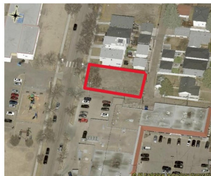
9115 143 St-Location