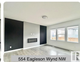
554 Eagleson Wynd NW